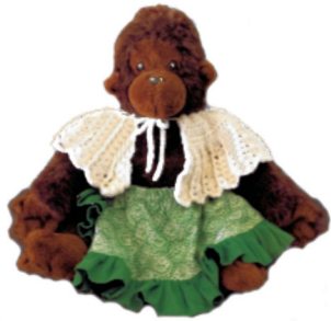
Gabby the Gorilla